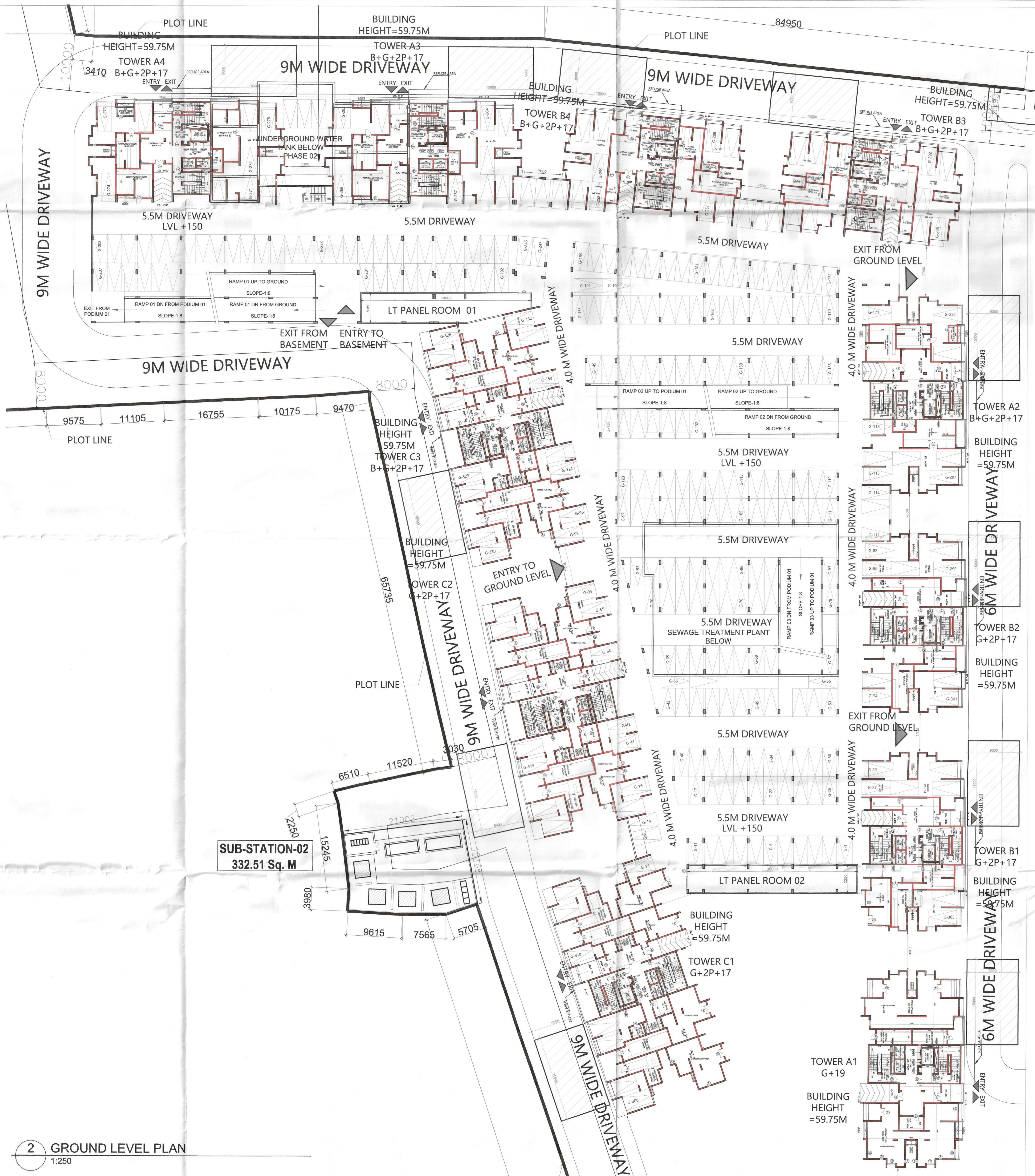
2 GROUND LEVEL PLAN 1:250

NOTES: • ALL DIMENSIONS ARE IN MM UNLESS IT IS MENTIONED. • FIRE-FIGHTING / SAFETY PROVISIONS WILL BE AS PER RELEVANT NBC PROVISIONS. • COVERING SLAB OF RESERVOIRS, FIRE TENDER PATH SHALL BE STRUCTURALLY SAFE FOR TAKING LOAD OF HEAVY VEHICLES LIKE FIRE TENDER. • ALL BUILDING WILL BE DESIGNED (STRUCTURES) AS PER RELEVANT I.S. CODES FOR EARTHQUAKE RESISTANCE. • PLEASE NOTE THAT THE DIMENSIONS IN THE DRAWINGS ARE TO BE READ, NOT MEASURED.